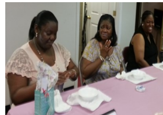
Are any of these ladies in the sleeping bags?

"With all lowliness and gentleness, with longsuffering, bearing with one another in love, endeavoring to keep the unity of the Spirit in the bond of peace". Eph. 4:2-3